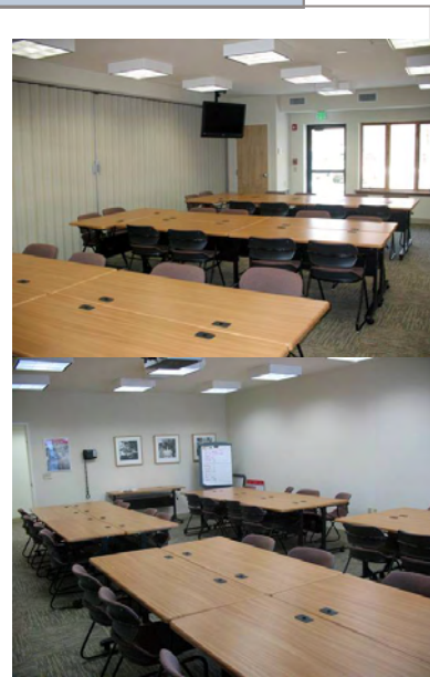
At right: two of the rooms set up for training