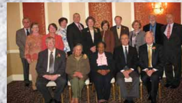
Past honorees return to celebrate!

Central Hudson Gas & Electric ~ Central Press ~ Jackson Lewis LLP The Poughkeepsie Grand Hotel ~ Precision Care ~ Toolbelt Media Inc.