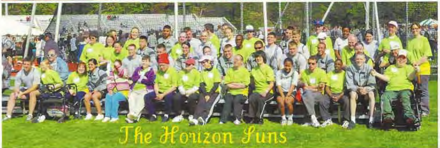
The Horizon Suns