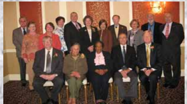
Past honorees return to celebrate!

Central Hudson Gas & Electric ~ Central Press ~ Jackson Lewis LLP The Poughkeepsie Grand Hotel ~ Precision Care ~ Toolbelt Media Inc.